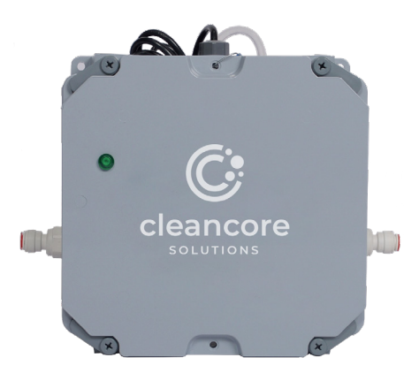
CCS1000 Ice System